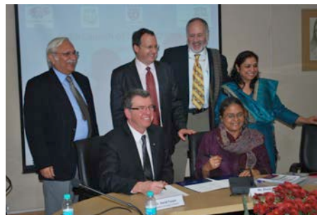
UNESCO Chair launch, India 2012