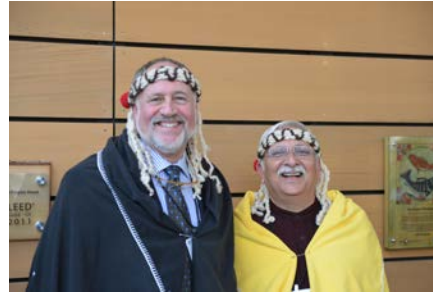
UNESCO Chair launch in Canada, December 2012

It was noted that The UNESCO Chair is the only one in the world jointly hosted by a northern university and a southern non-governmental organization. The focus of the chair's program is to build research capacity in the field of community-based research and social responsibility in higher education in the Global South.