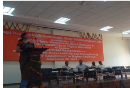
Sonipat Symposium, India, September 2012