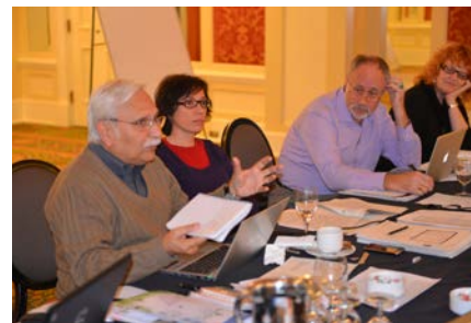
GUNi Academic Symposium, Victoria, March 2013