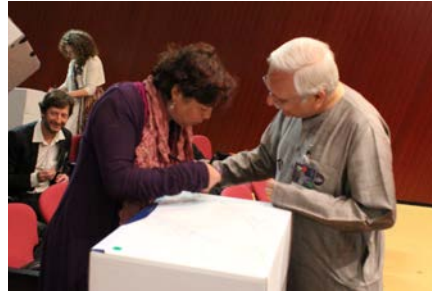
6th International Conference on Higher Education, Spain, May 2013