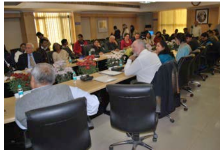
UNESCO Chair launch in India, December 2012