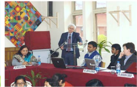
LSR Seminar, India, January 2014